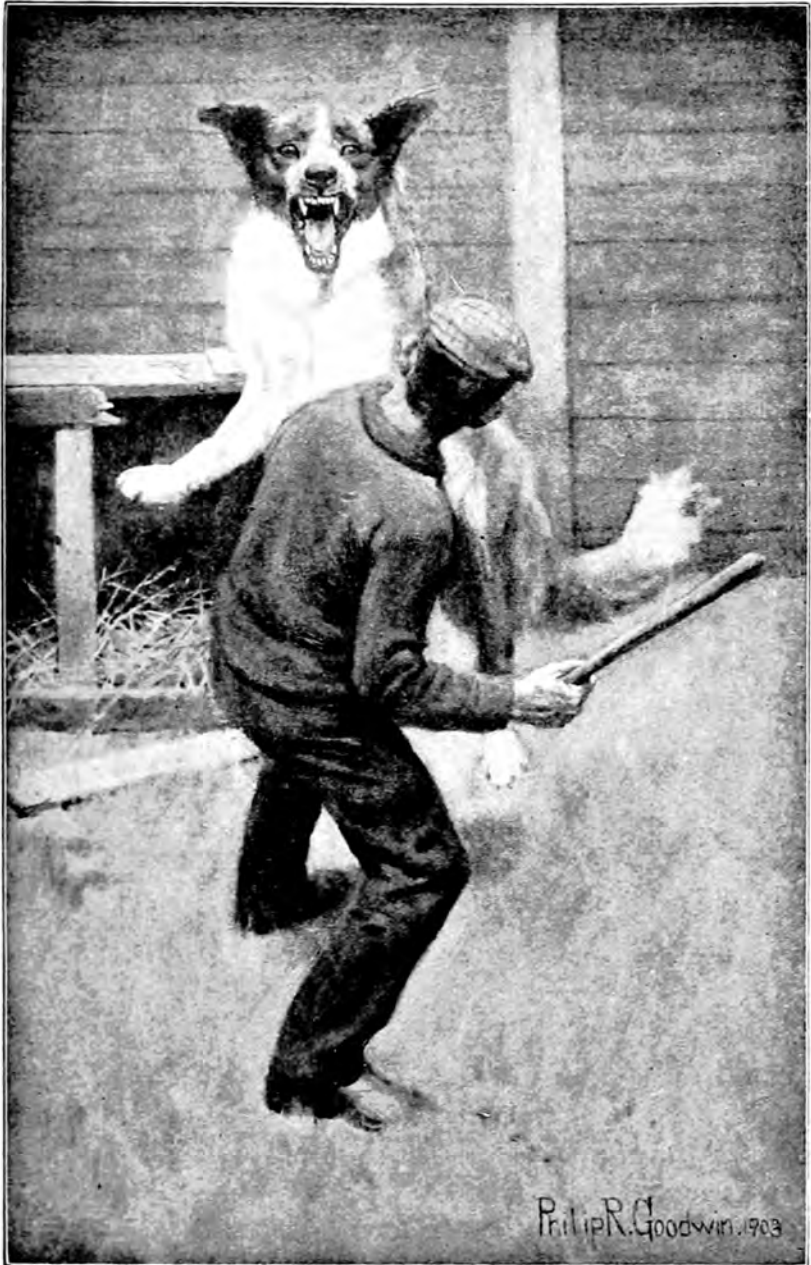
"Straight at the man he launched his one hundred and forty pounds of fury."