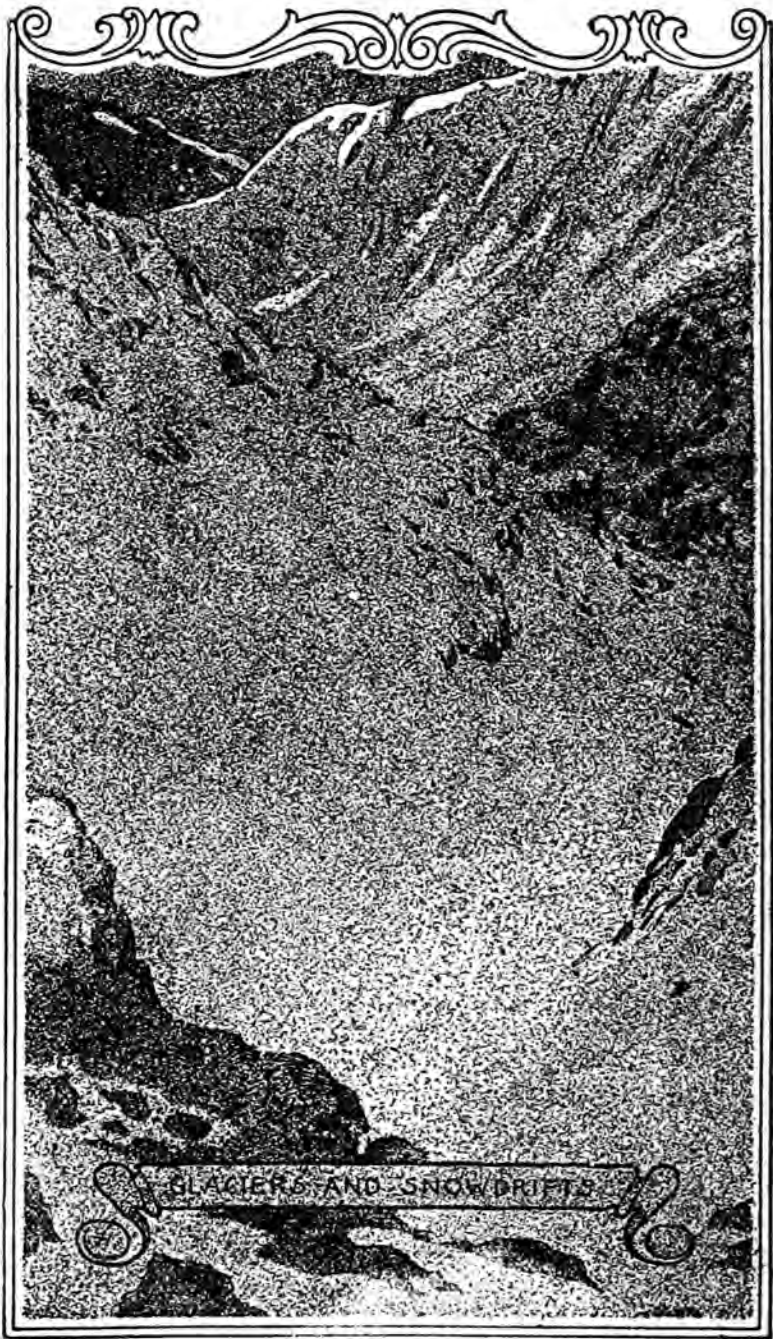
GLACIERS AND SNOW DRIFTS